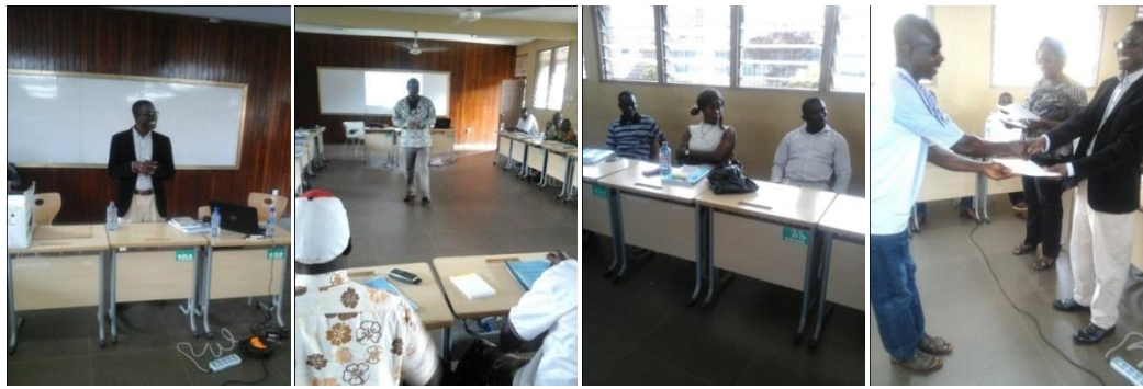
Figure 4: Pictures from opening, facilitation to the closing ceremony.