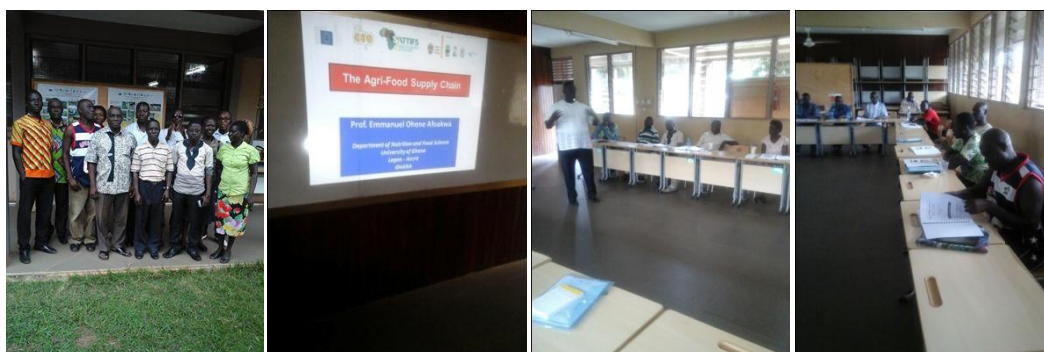
Figure 1: Group photograph and facilitation during the TOT Workshop

The residential training took place at the University of Energy and Natural Resources, Sunyani from Wednesday August 26 th to Sunday August 30 th and continued from Monday September 7 th to Wednesday September 9 th 2015.