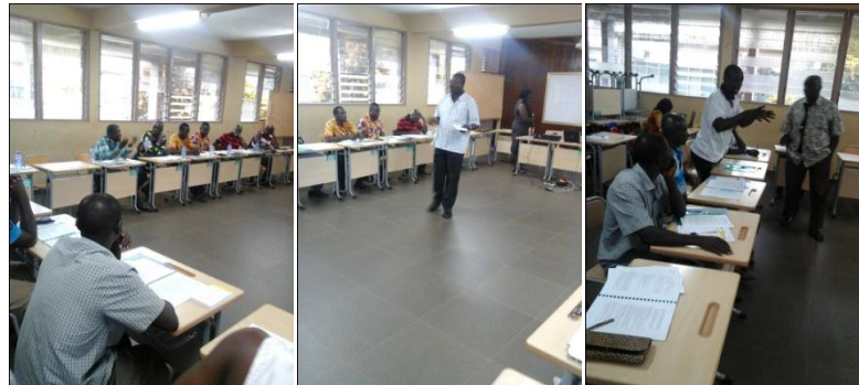
Figure 2: Participants contributing to discussions during the TOT workshop